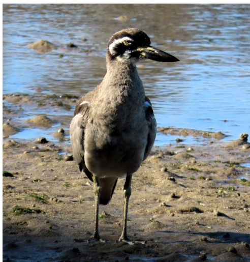
Beach Stone-curlew