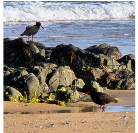
Sooty Oystercatchers

On a trip to Gunnai Beach, near Bemm River, Victoria, it was great to see 3 pairs of Hooded Plovers, spread over 3 kilometres. A pair of Sooty Oystercatchers foraged at the water's edge with a family of Pied Oystercatchers, a juvenile White-bellied Sea-Eagle flew along the shoreline and Dusky Woodswallows made forays above the dunes. At the campground there were Eastern Whipbirds, a Shining Bronze-Cuckoo and a Fan-tailed Cuckoo, just some of the many species living in the wattles and banksias. It was a lovely, peaceful week, just before the Christmas holiday rush started.