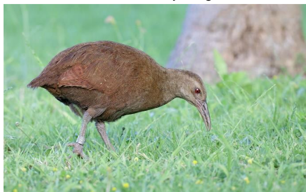
Lord Howe Woodhen

At Lord Howe Island in October, elegant Black Noddies showed their amazing flying skills and use seaweed to line their nests. Bar-tailed Godwits, Buff-banded Rails, Emerald Dove, Flesh-footed Shearwater, Golden Whistler on Kentia Palms and Grey Ternlets were encountered. Over 2000 Lord Howe Woodhens have come back to the island since feral animals have been eliminated. Pacific Island Plovers were plentiful at the airport. A Lord Howe subspecies of Currawong sounded more like a Channel-billed Cuckoo.