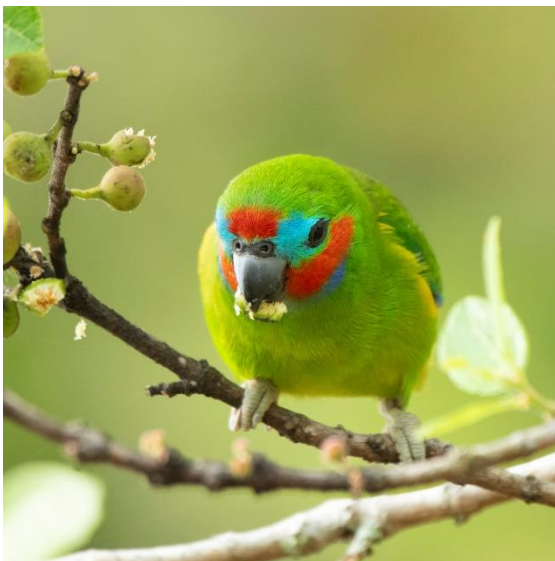
Double-eyed Fig Parrot