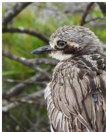
Bush Stone-curlew

The Bush Stone-curlew is also known as the Bush Thick-knee, and more colloquially, murderbird. This nickname comes from their haunting call, which sounds like a human scream.